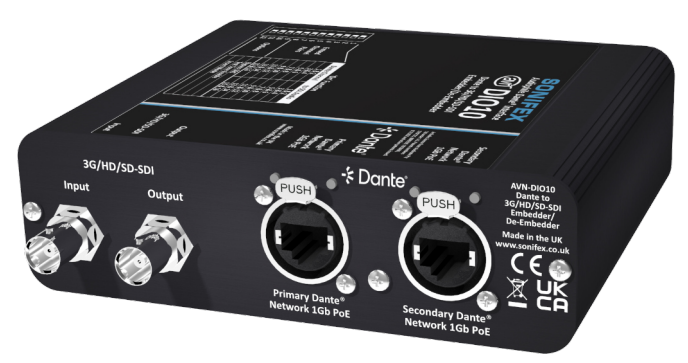
Fig 1-6: AVN-DIO Rear Iso View Shown without Accessories