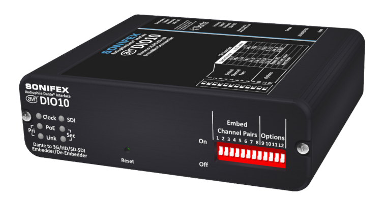
Fig 1-5: AVN-DIO Front Iso View Shown without Accessories