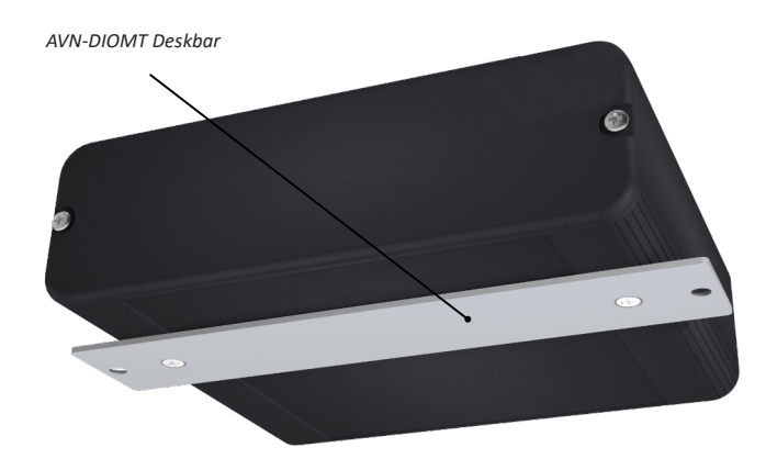
Fig 1-4: Iso View Shown with AVN-DIOMT Deskbar Attached